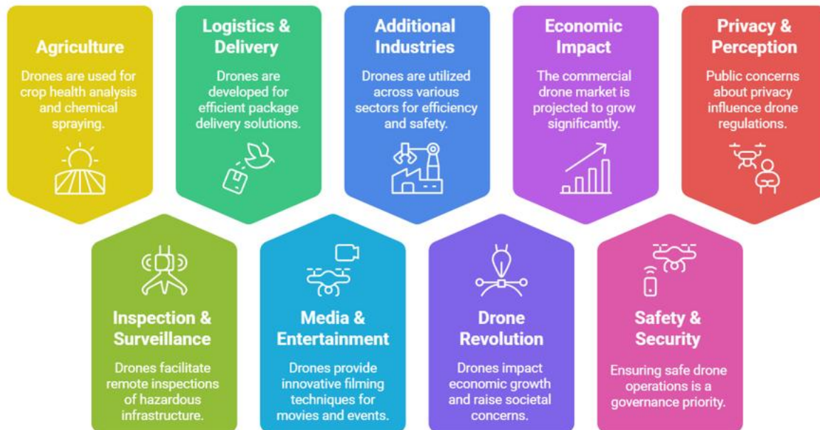
Fig -2: Applications of Drones

leverage drones for an emerging array of applications. Whether inspecting critical infrastructure, assessing crop health or filming blockbuster movies, drones are proving uniquely suitable for hazardous, repetitive or precise tasks traditionally performed through costly and risky manual means.